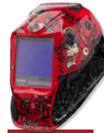
VIKING™ 3350 Mojo™