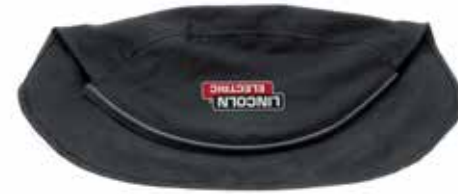
FLAME RETARDANT COTTON EXTENDED PROTECTION WP202204

LINCOLN ELECTRIC Flame retardant cotton extended protection for head with Press Fit silicone Seal