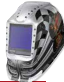
VIKING™ 3350 Motorhead™