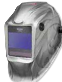
VIKING™ Heavy Metal®