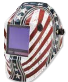
VIKING™ 3350 Dardevil