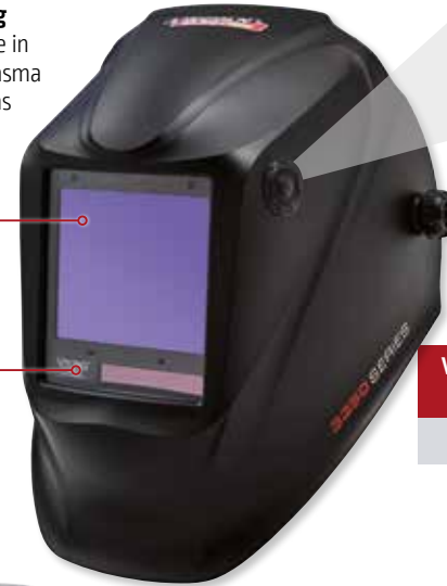
VIKING™ 3350 BlackMat