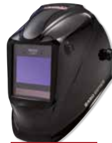
VIKING™ 2450 Black

WHAT'S INCLUDED: Comes with helmet bag, bandana, 5 outside cover lenses, 2 inside cover lenses and sticker sheet.