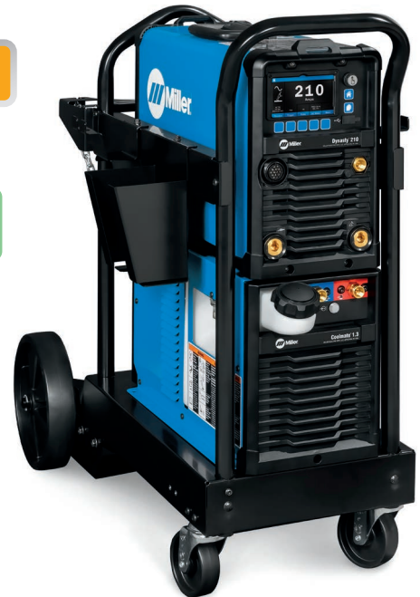
Dynasty 210 water cooled Tigrunner package