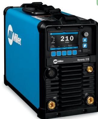
Dynasty 210 Machine only