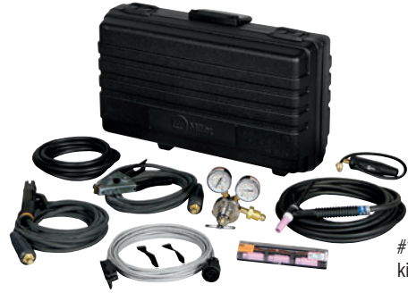
#195 055 kit shown.