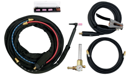
#300 990 kit shown.