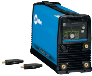
#907 552 Maxstar shown.

Select desired stock number for each step.