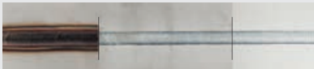
/ CrNi before cleaning